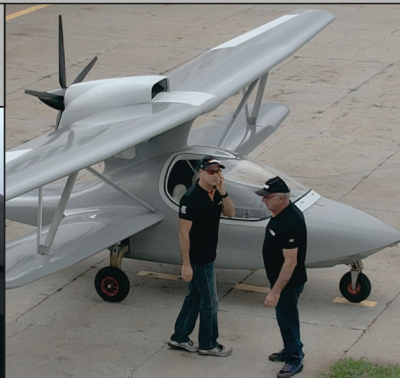
New canopy design