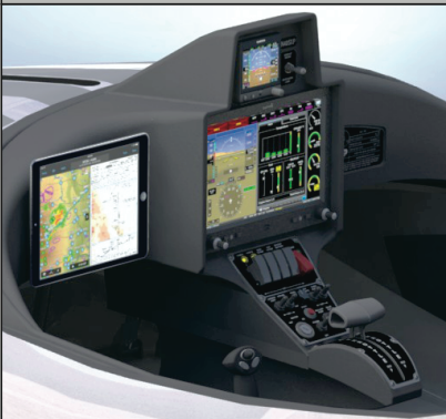
Central panel and console with GARMIN G3X/G5