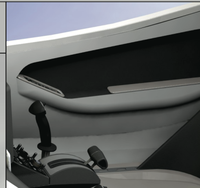
Side arm rest with niches for BOSE headset controls